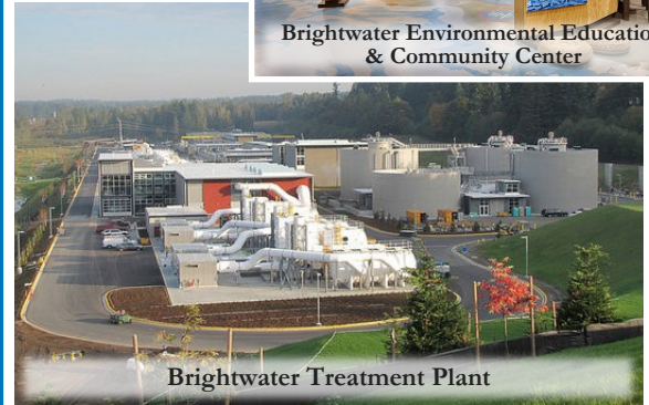
Brightwater Treatment Plant